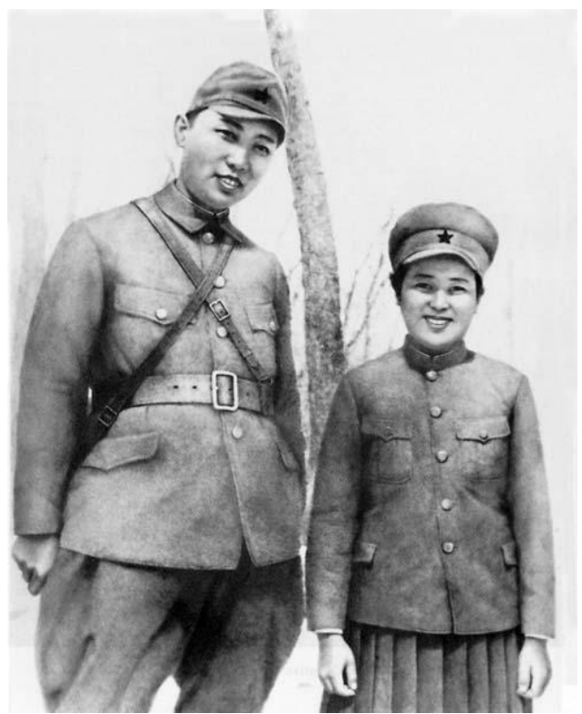
Kim Jong Suk posing with Kim Il Sung in the days of the anti-Japanese armed struggle