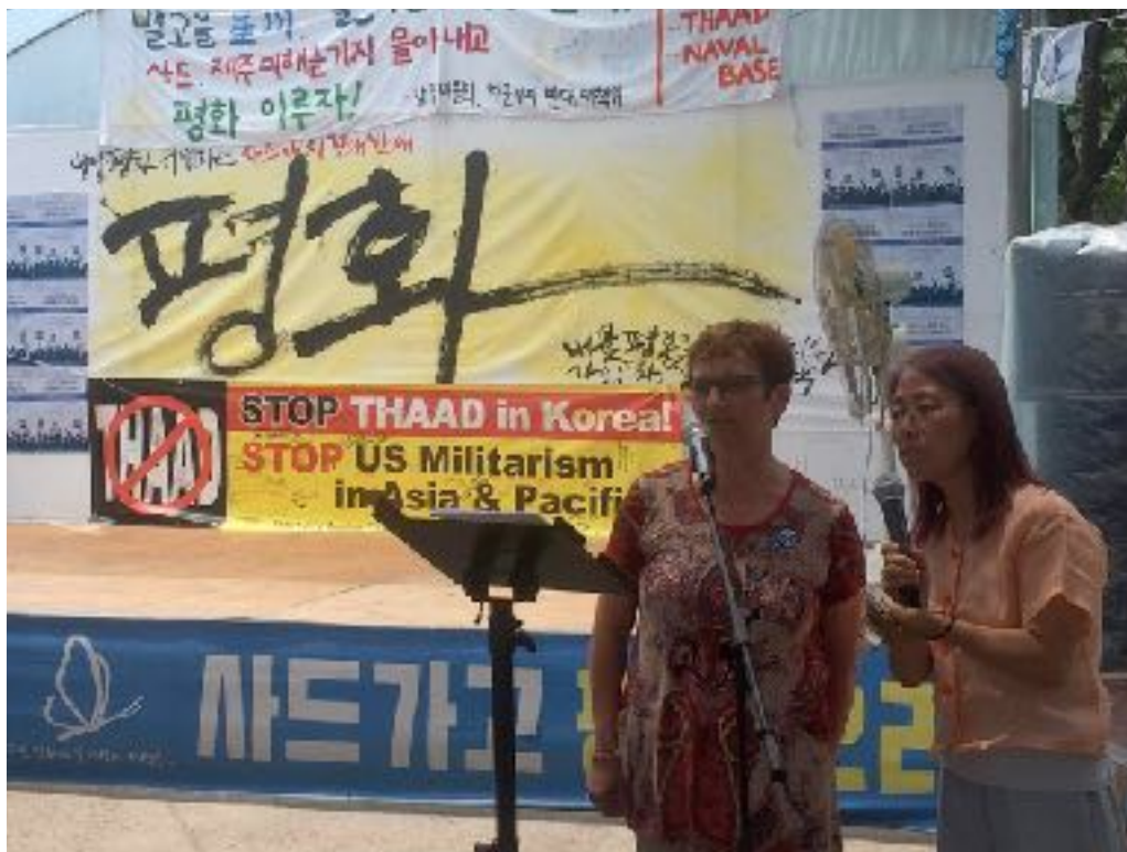
▲Inge Höger visits So-seong-ri to express her solidarity with the struggle against THAAD, July, 9.